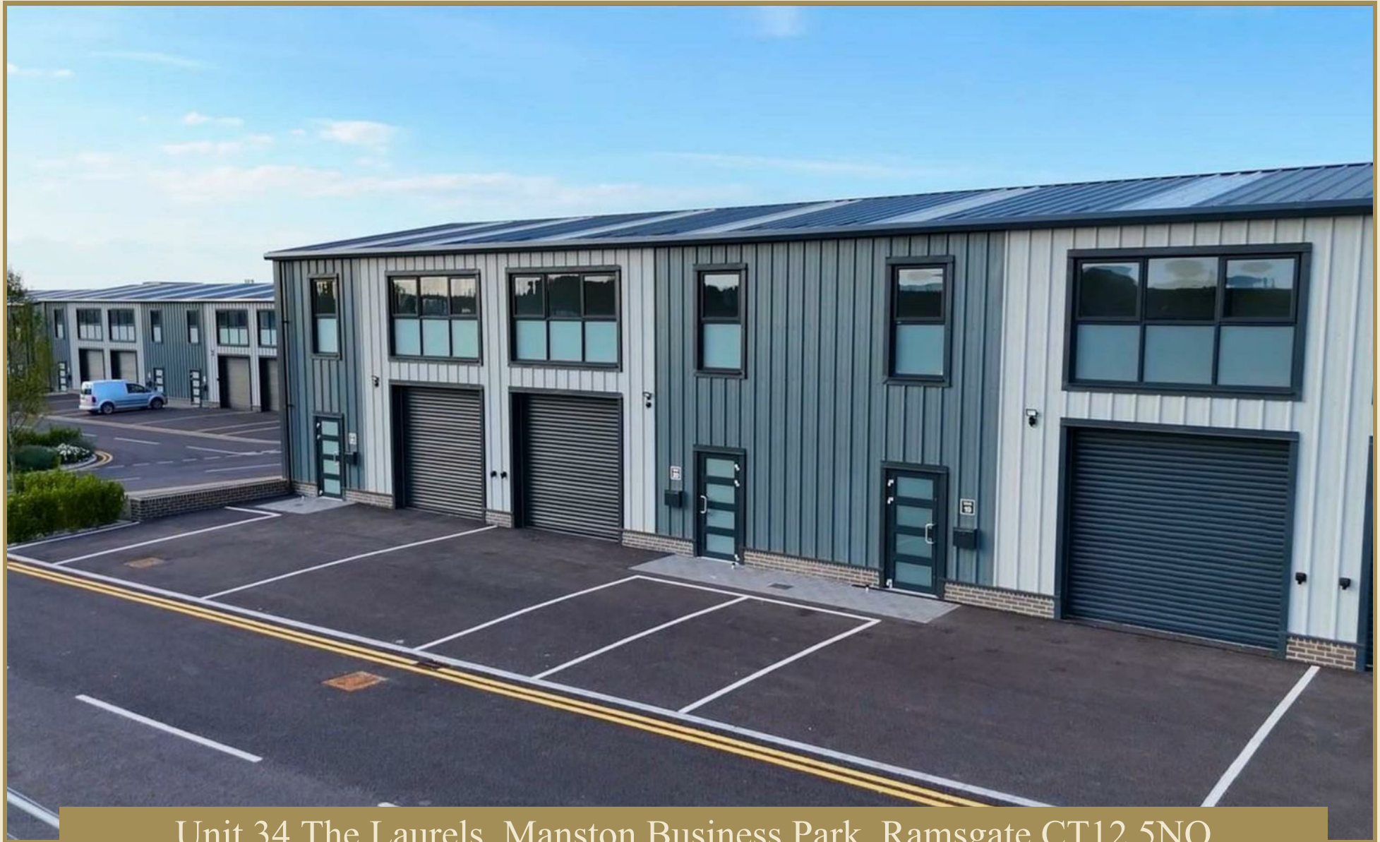
Unit 34 The Laurels, Manston Business Park, Ramsgate CT12 5NQ