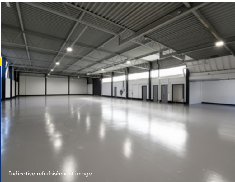
Indicative refurbishment image