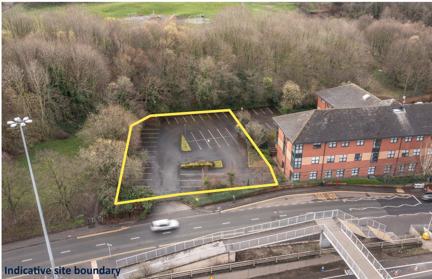
Indicative site boundary