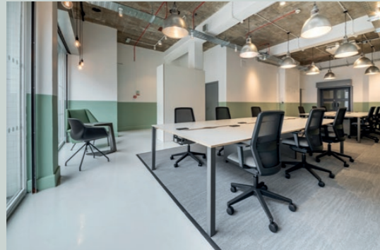
Your own welcome area and desk space - ground floor

Fees paid for introductions. 10% of Year 1 Revenues available under simple, pre-agreed short contracts.