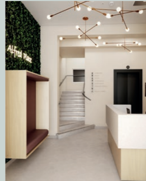
Newly refurbished contemporary entrance hall to main building