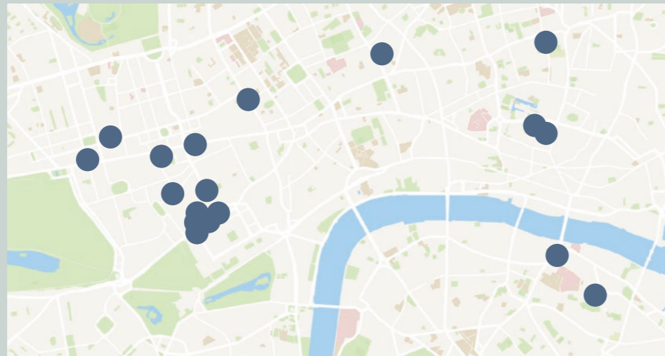
GPE flex space

At GPE, we've delivered a 120,000 sq ft flex portfolio with 120,000 sq ft more in the pipeline. That makes us one of London's largest providers of flex space.