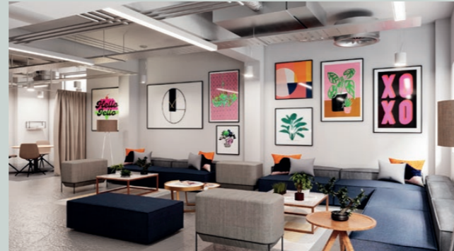
Your own welcome area - 1st floor