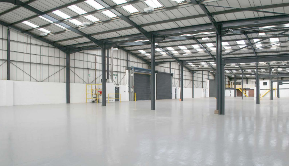
Unit A – Refurbished 20,333 sq ft with own large secure yard