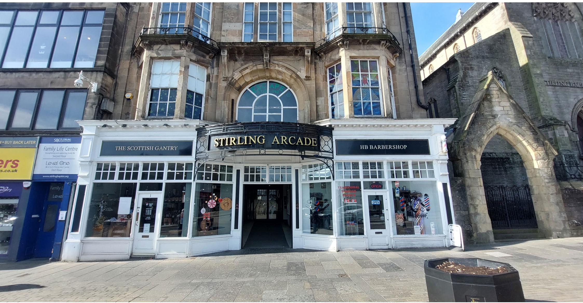
Stirling Arcade, Stirling, FK8 1AX