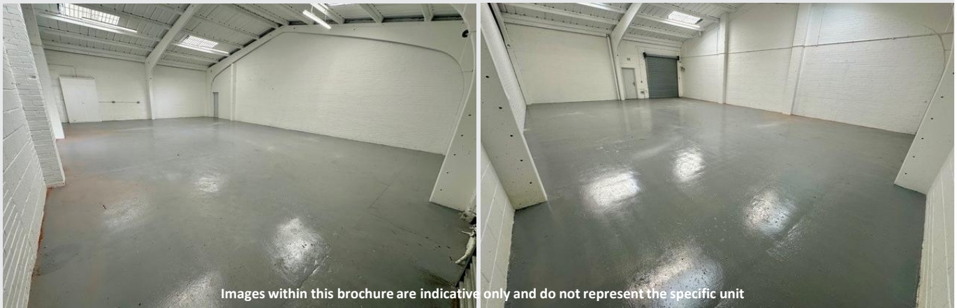
Images within this brochure are indicative only and do not represent the specific unit