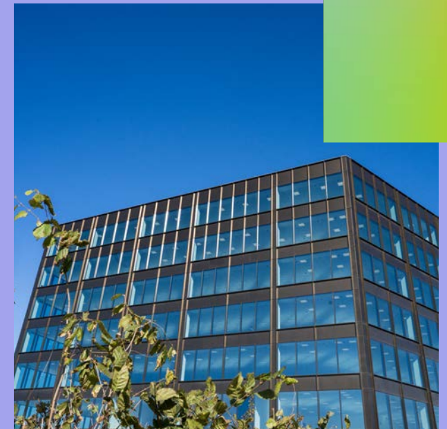
Thorpe Park, Leeds