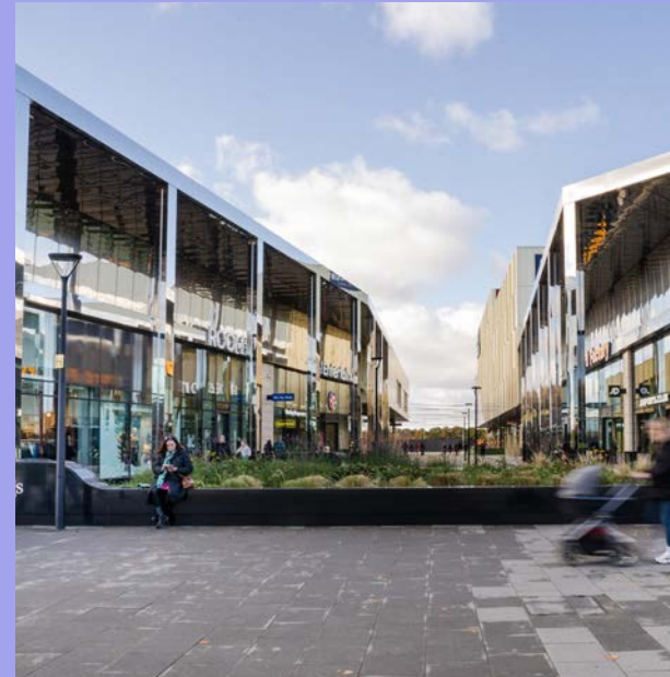
The Springs, Leeds