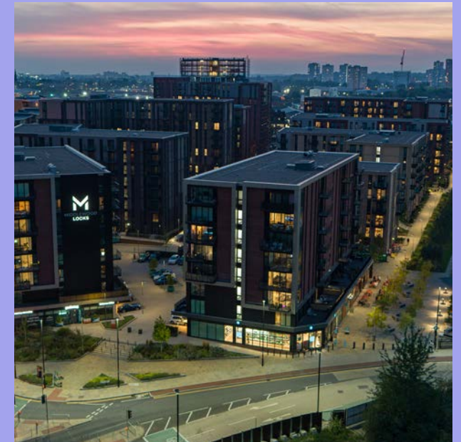
Middlewood Locks, Salford