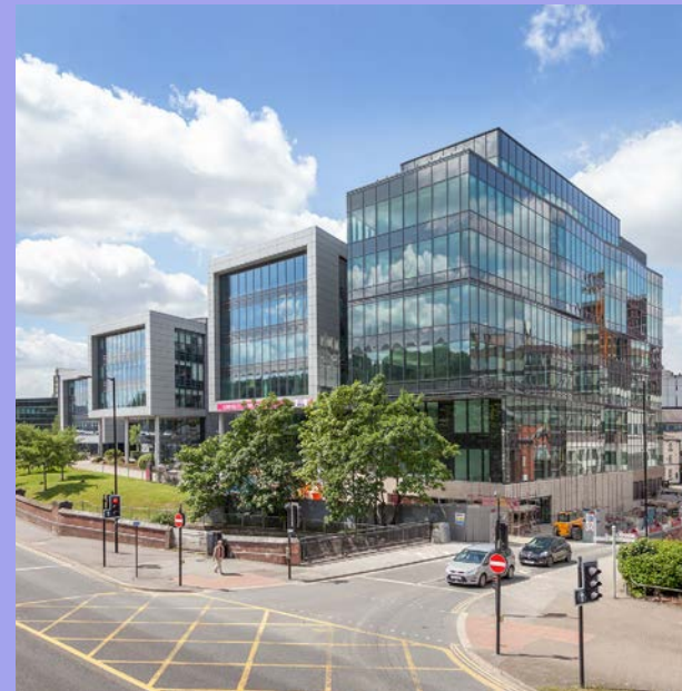
Sheffield Digital Campus