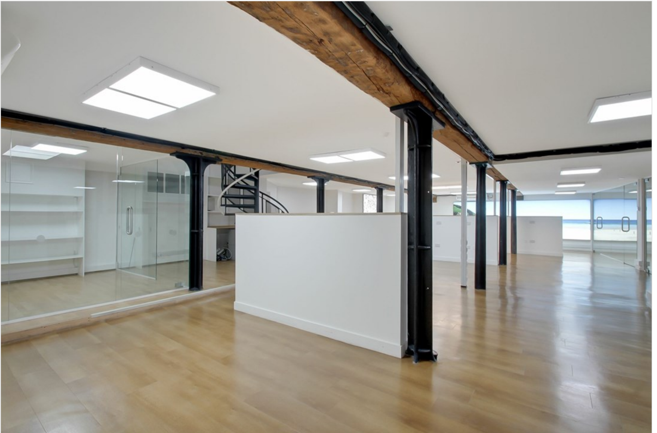
5 Maidstone Buildings Mews, London, SE1 1GN