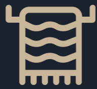
Shower & drying room