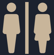
Separate ladies & gents