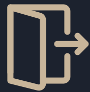
Break out areas