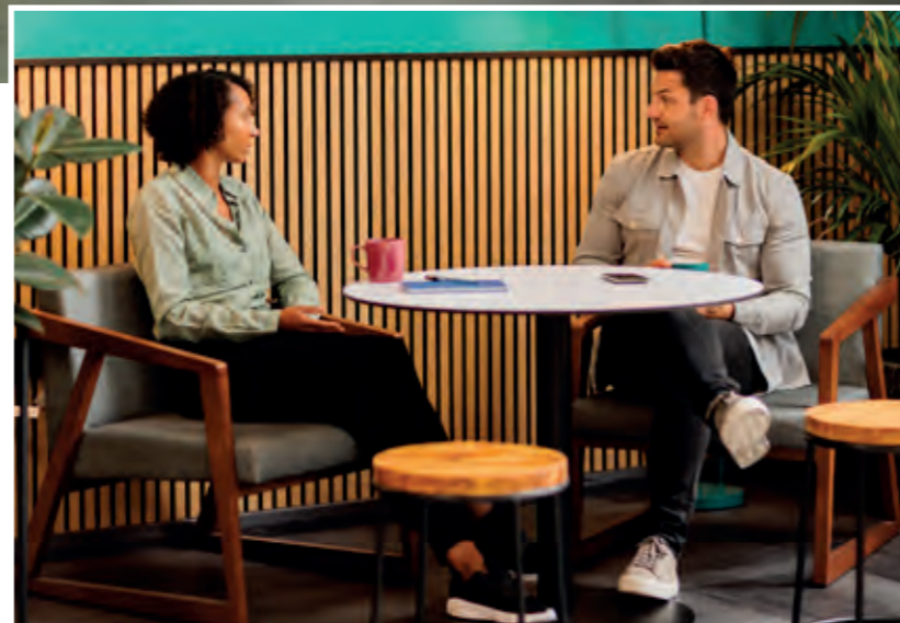
Image shows tenant fit-out