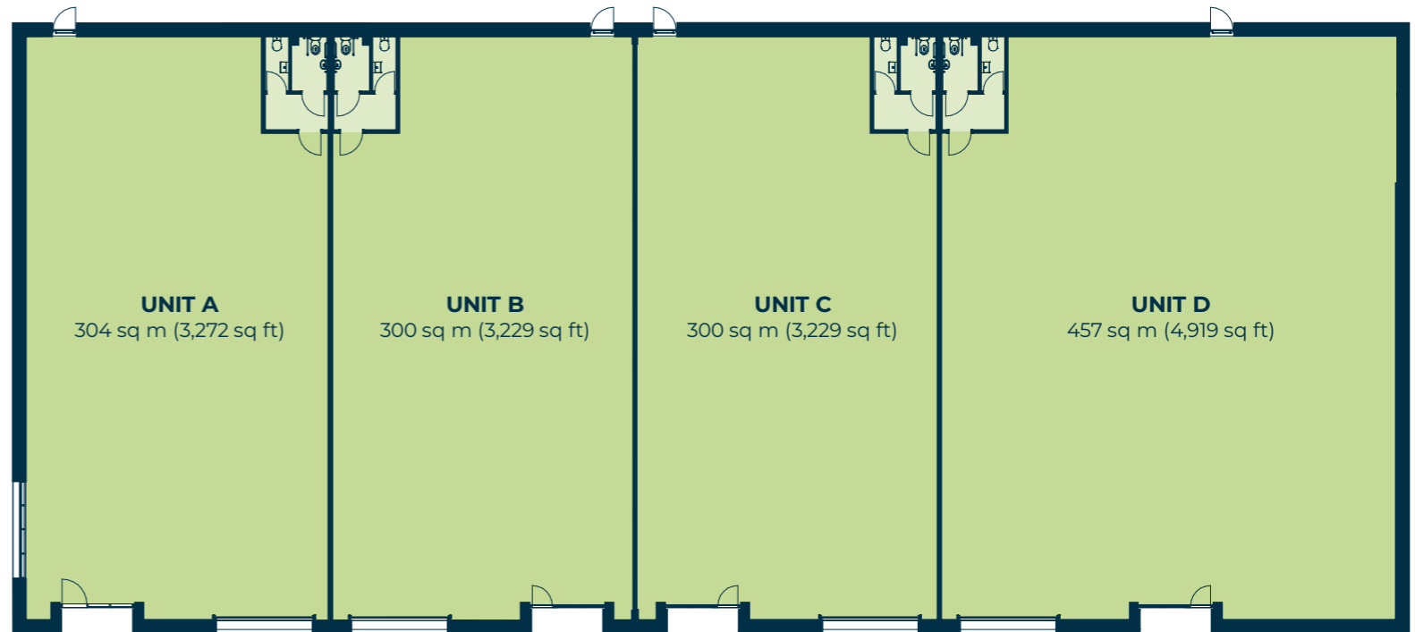
Sample floor layout plan