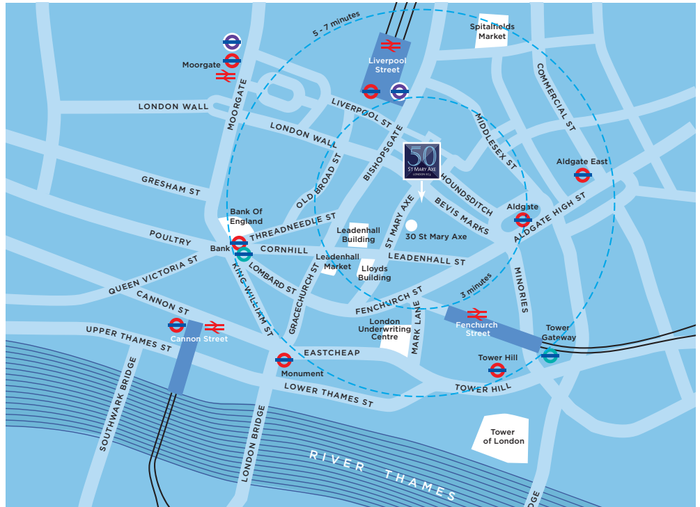
Designed and produced by Purplefish www.purplefish.com

50 St.Mary Axe is ideally located in the heart of the Tower cluster bordering the traditional insurance and banking locations of the City.