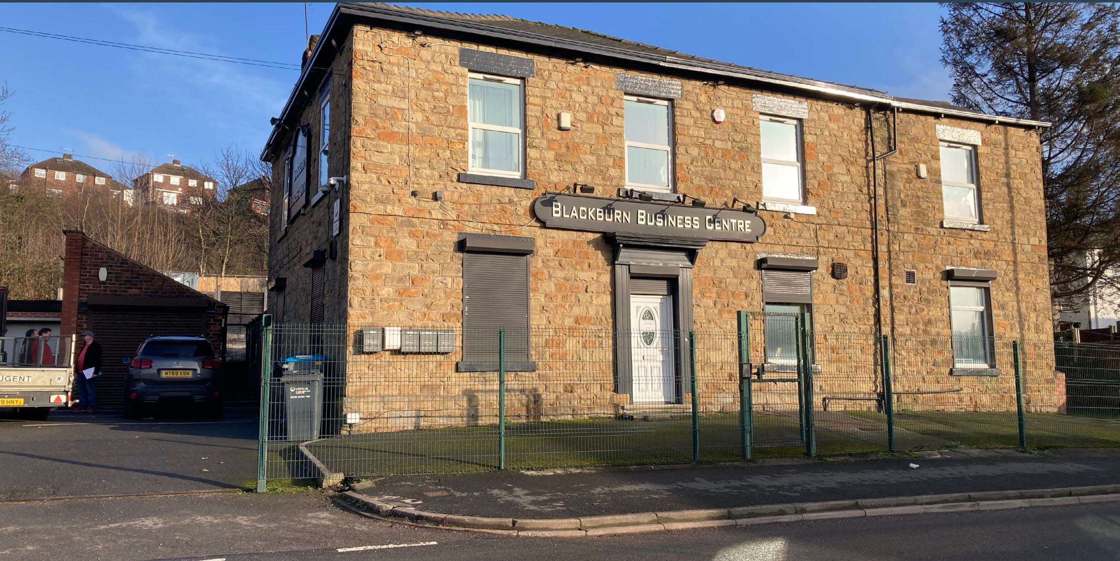
Blackburn Business Centre, Blackburn Road, Rotherham S61 2DW