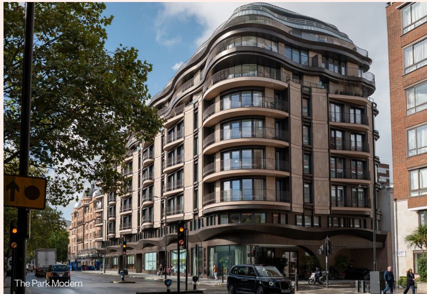
The Park Modern