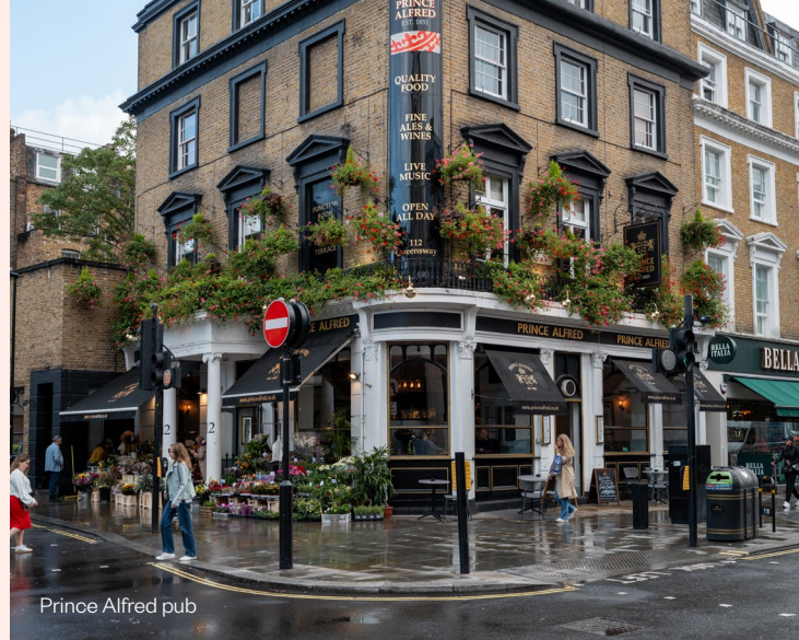
Prince Alfred pub