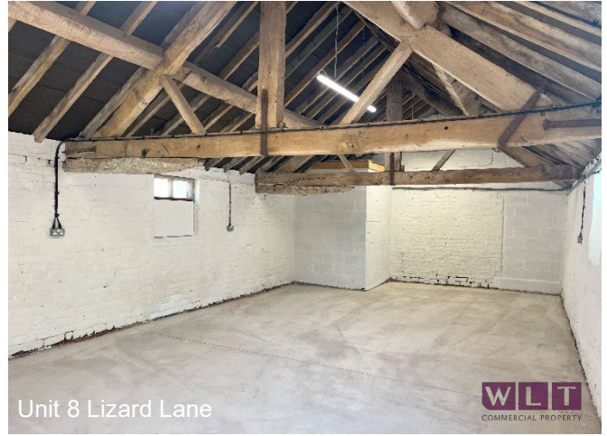
Unit 8 Lizard Lane