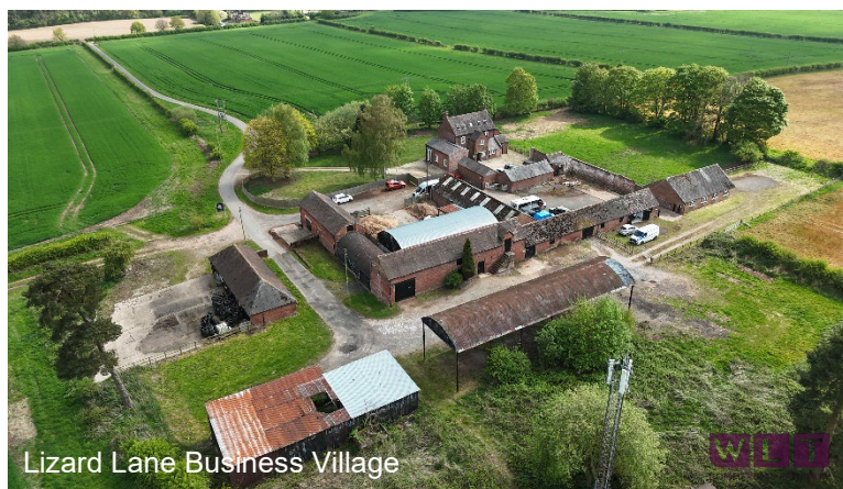
Lizard Lane Business Village