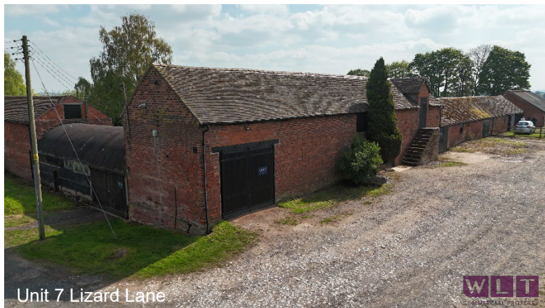
Unit 7 Lizard Lane