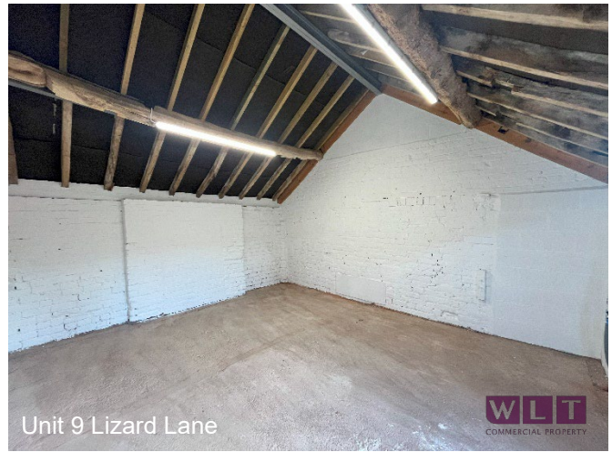
Unit 9 Lizard Lane