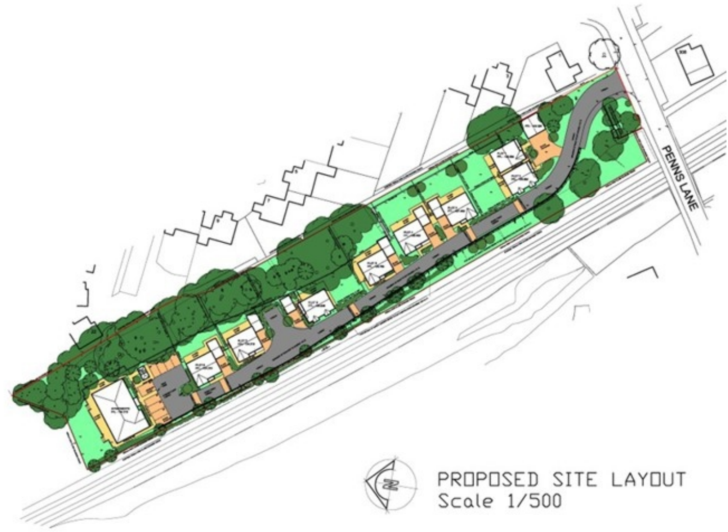
PROPOSED SITE LAYOUT Scale 1/500