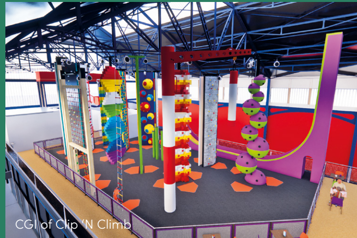
CGI of Clip 'N Climb

The entire multi-million-pound Dockside complex spans 2 key buildings and boasts an array of shops, leisure, medical and office uses. Key leisure anchors include a 9-screen Odeon cinema, Ninja Warrior, Wagamama, Zizzi and McDonalds whilst the anchor retail occupiers include M&S, The Range, Holland & Barrett, Moss and ProCook. The successful office and medical hub is located on the upper floor.