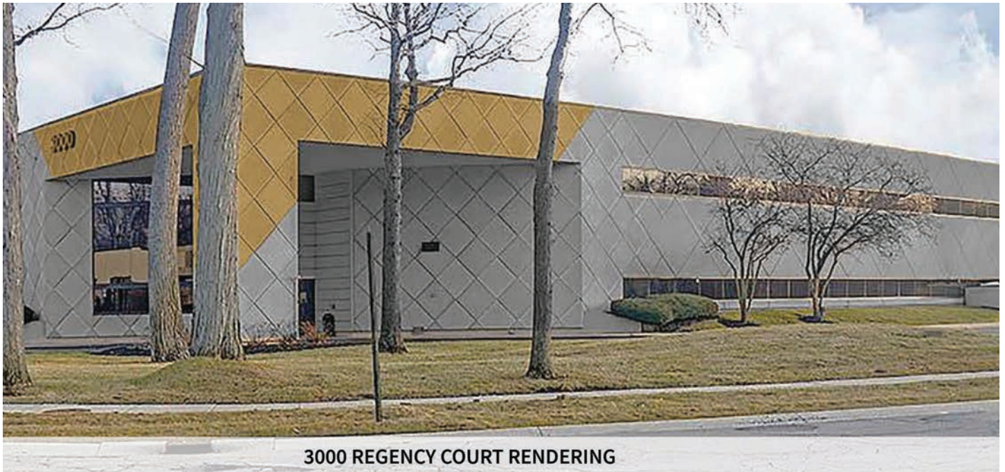
3000 REGENCY COURT RENDERING