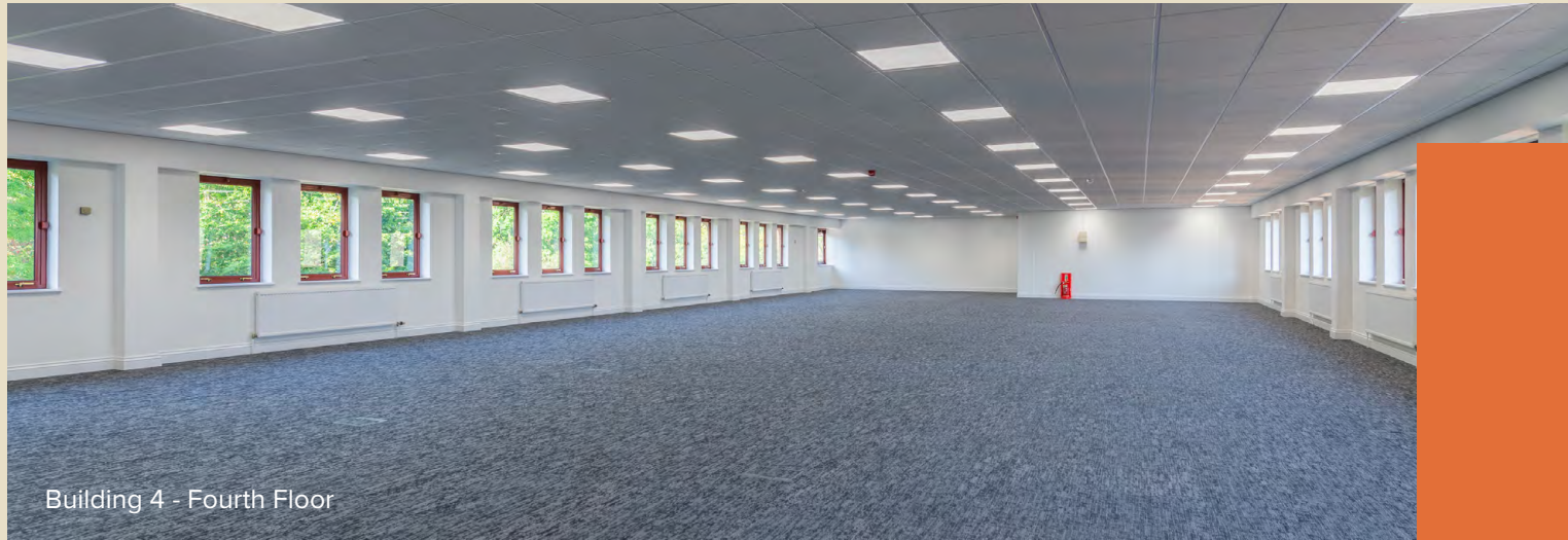
Building 4 - Fourth Floor