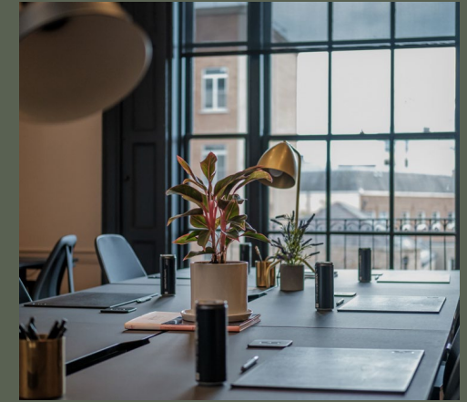
ELY HOUSE FULLY OCCUPIED