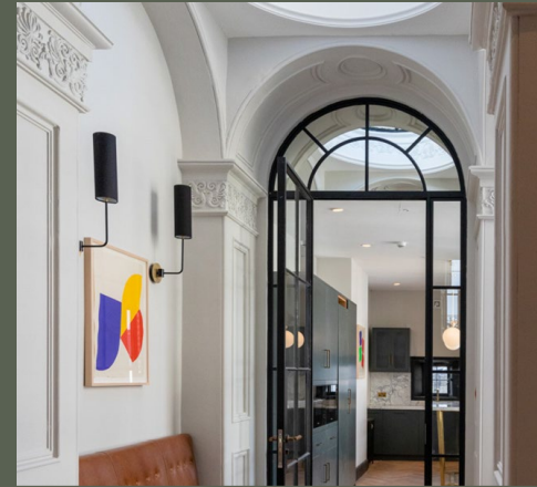
LEESON HOUSE FULLY OCCUPIED

Need to host an important meeting? Book one of our conference rooms to ensure you have everything organised and to hand. Everything you need is within reach when you choose to run your business in one of our beautifully-presented, fully-serviced buildings, which combine modern technology with contemporary design and mature architecture. We'll take care of all the little essentials so that you can focus on what you do best.