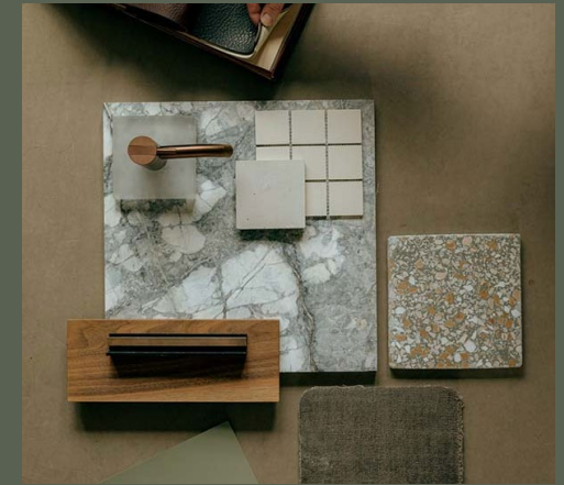
THE LOFTS COMING OCTOBER 2022