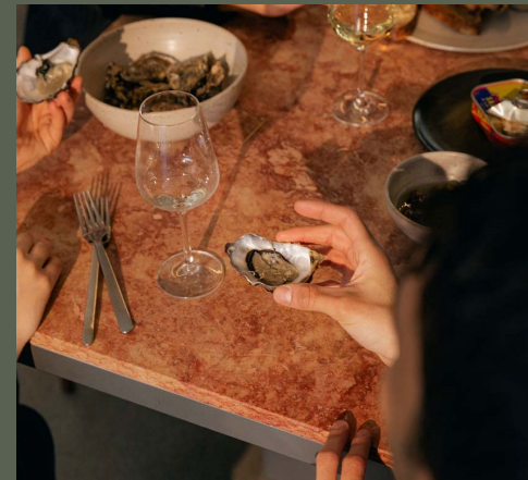
TOM'S HOUSE COMING SEPTEMBER 2022