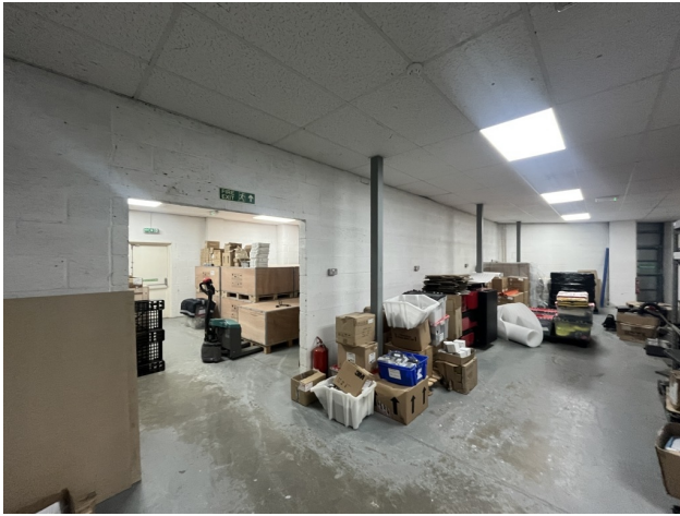
Ground Floor Warehouse