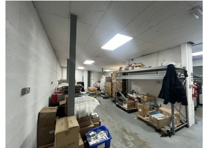
Ground Floor Warehouse