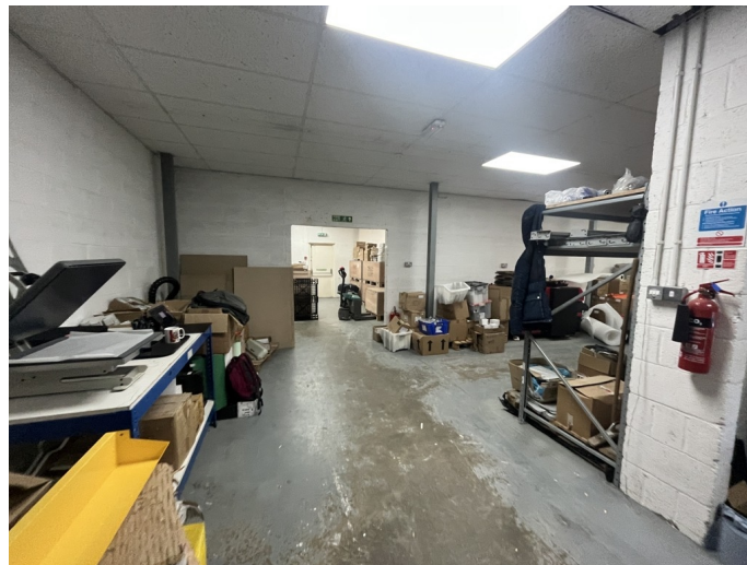
Ground Floor Warehouse