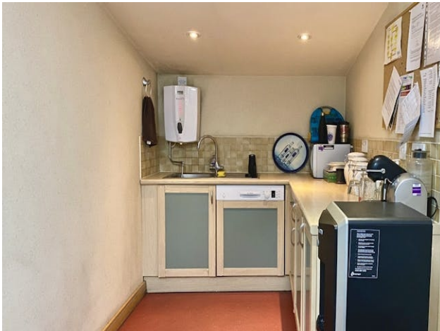
First Floor Kitchen