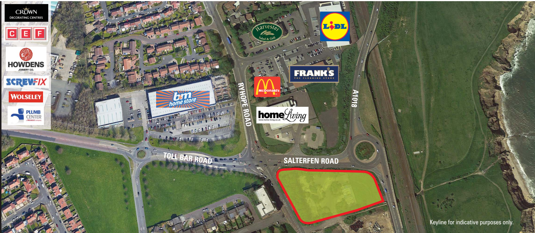
Keyline for indicative purposes only.