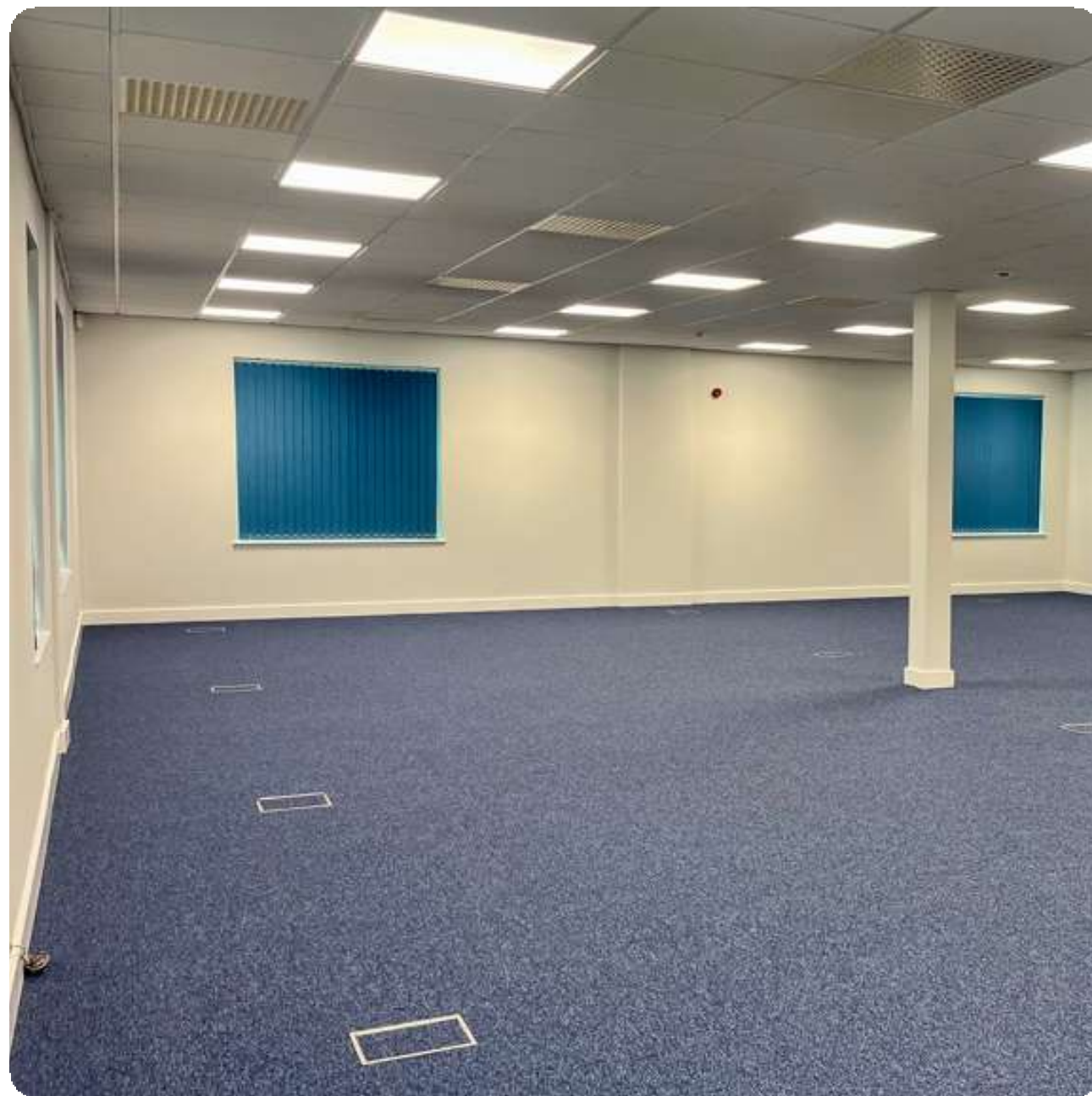
Cobalt Centre - Unit 1 (Ground Floor), Siskin Parkway East, Middlemarch Business Park, Coventry, West Midlands, CV3 4PE