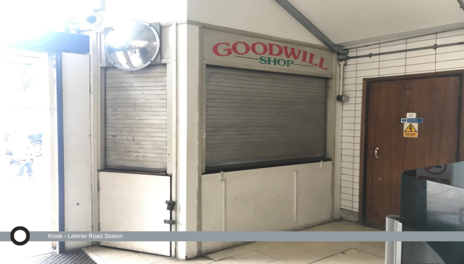
Kiosk - Latimer Road Station