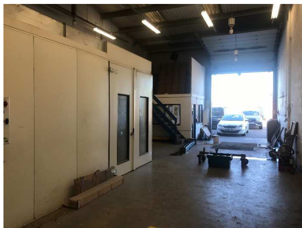
Spray booth to be removed

INDUSTRIAL/WAREHOUSE UNIT 1,551 SQ. FT. (144.1 M 2 ) TO LET