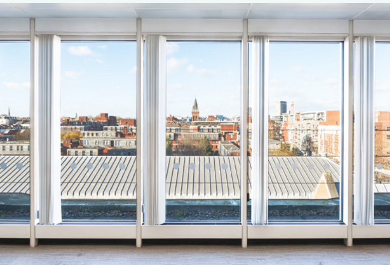
TYPICAL UPPER FLOOR 17,941 SQ FT / 1,667 SQ M