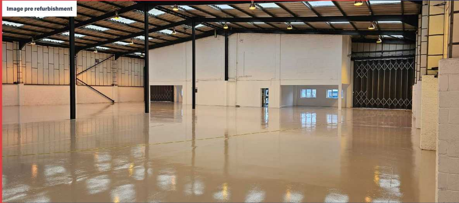
Image pre refurbishment