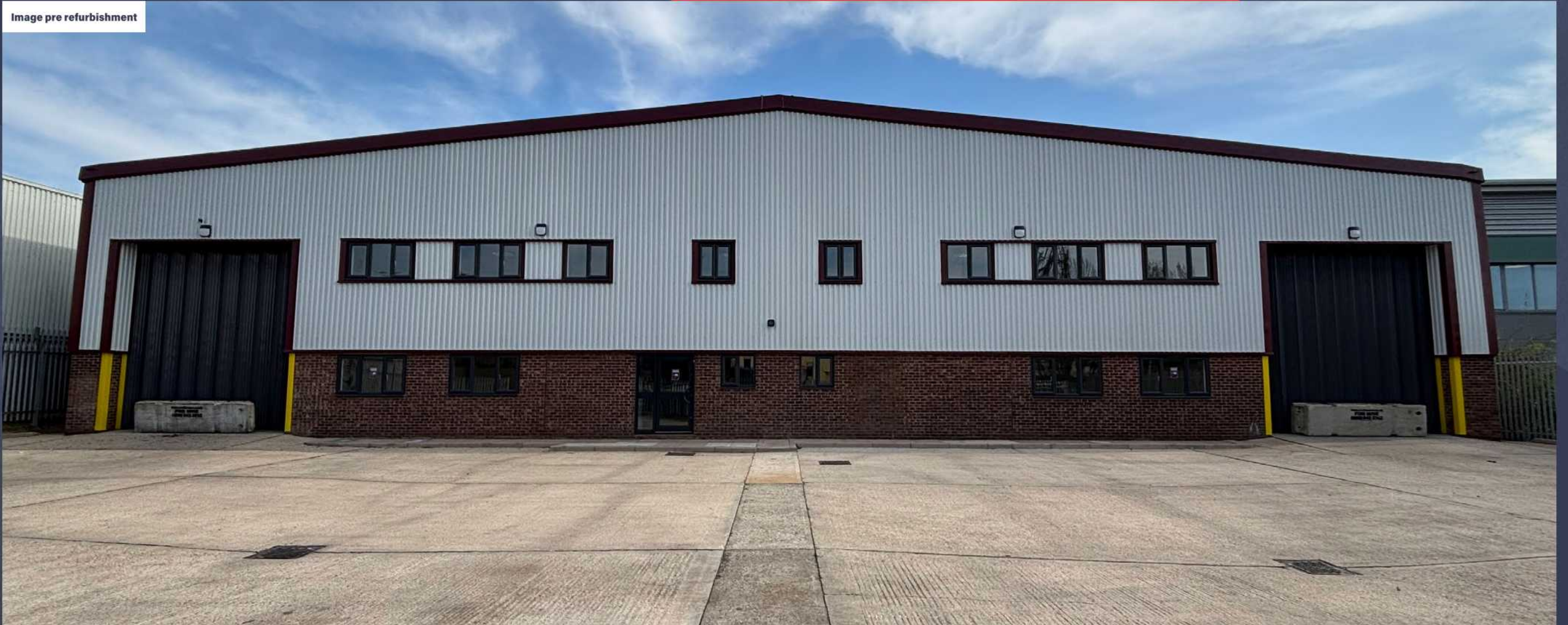
Image pre refurbishment

DUKES PARK INDUSTRIAL ESTATE CHELMSFORD ESSEX CM2 6TE