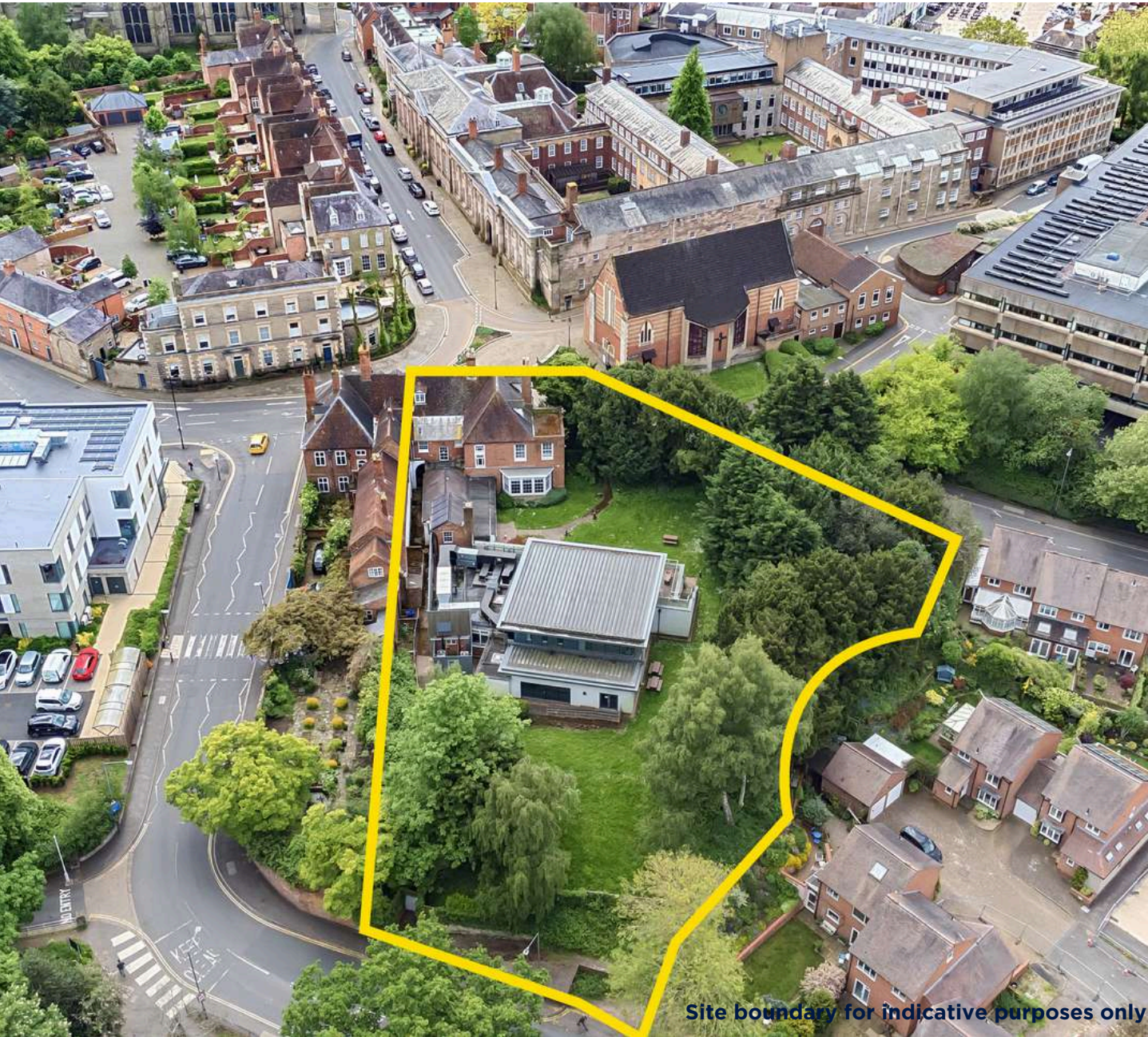
Site boundary for indicative purposes only