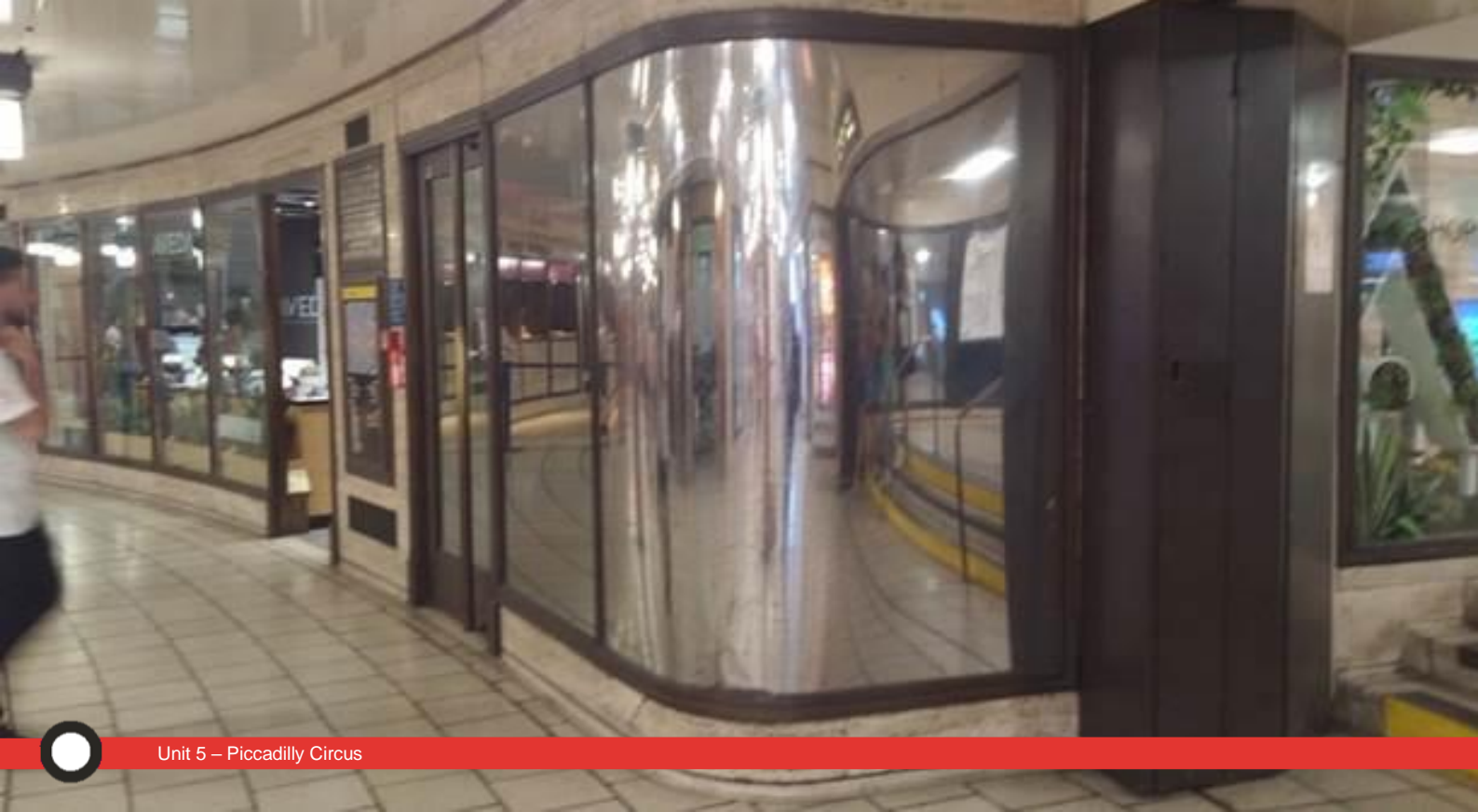
Unit 5 – Piccadilly Circus