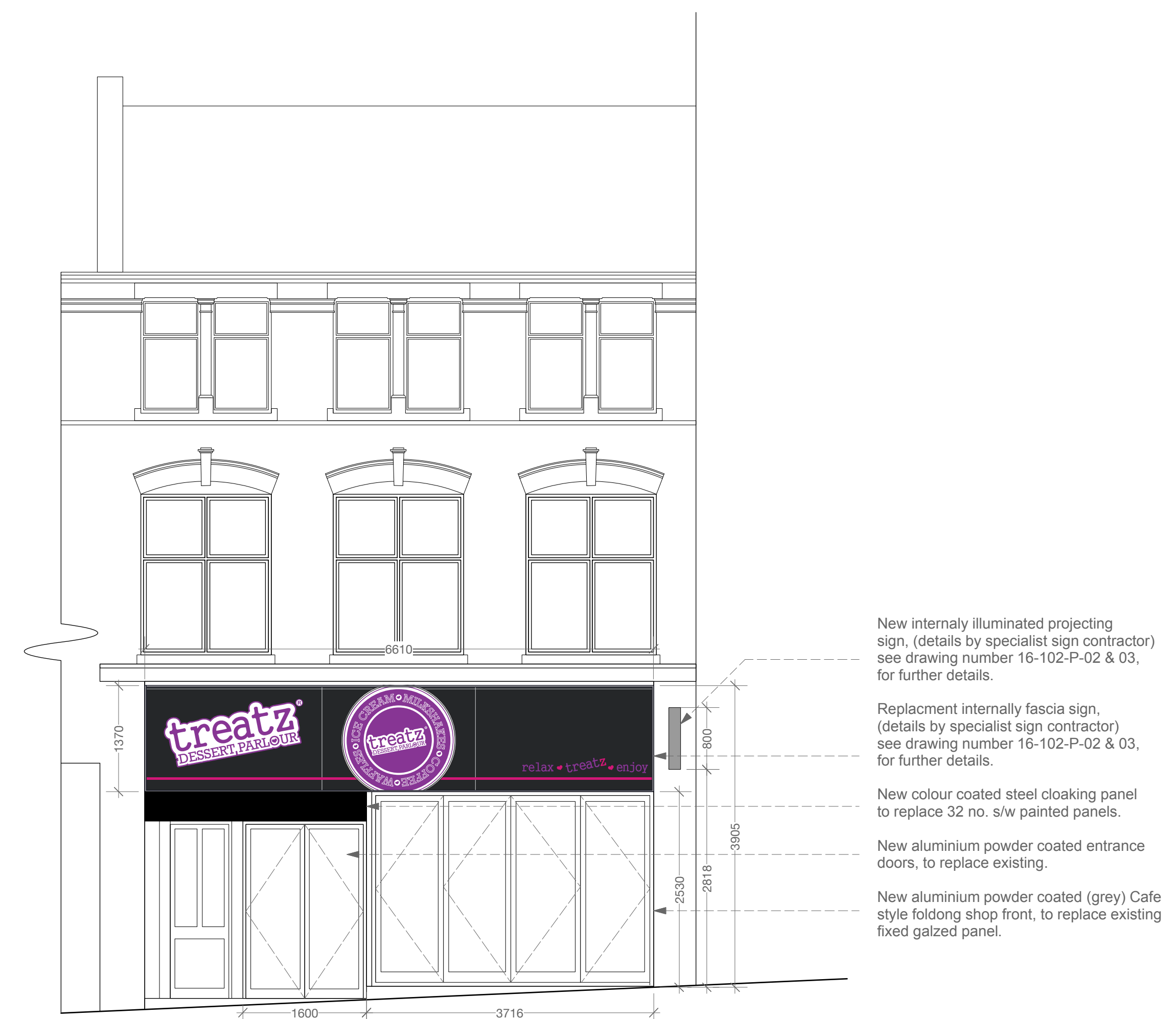
Proposed Elevation to Upper George Street.

DISCLAIMER: Any plans, drawings and/or prototypes, descriptions, illustrations, dimensions or specifications are approximate only and are only issued for the purpose of giving an impression of the look and feel of the Goods and/or Services described in them. They must not be taken as binding in detail and HAY Innovations Limited will not be liable for any error or omission. These plans, drawings or specification are not drawn to scale. Please do not scale from this drawing. Figured dimensions should be taken in preference to scaled dimensions, and any discrepancies must be verified at HAY Innovations Limited. Contractors, sub-contractors and suppliers must refer all dimensions on site before commencement of works. If in doubt ask! COPYRIGHT NOTICE Copyright © HAY Innovations Limited 2009 The reproduction or transmission of all or part of this work whether by photocopying or storing in any medium by electronic means or otherwise, without the written permission of HAY Innovations Limited is strictly prohibited.