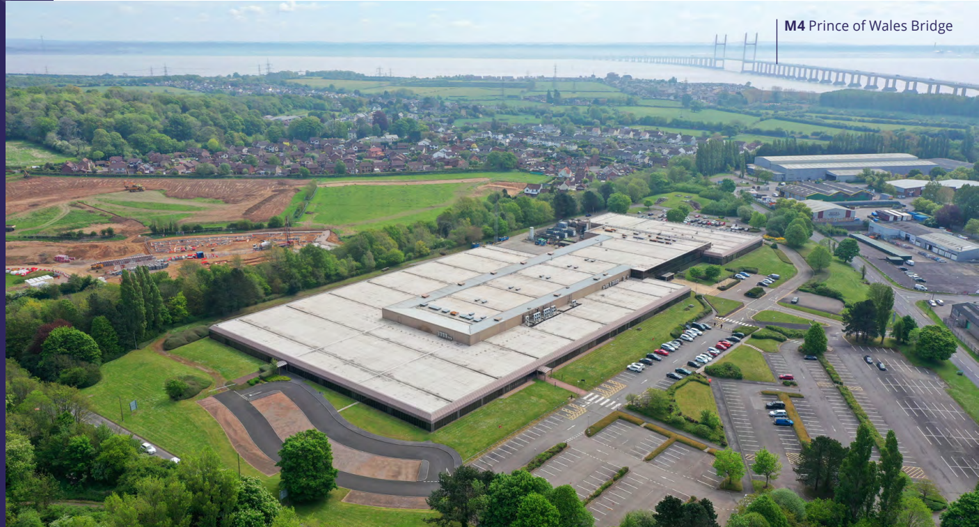
M4 Prince of Wales Bridge