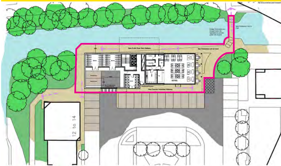
Area to be sold for development