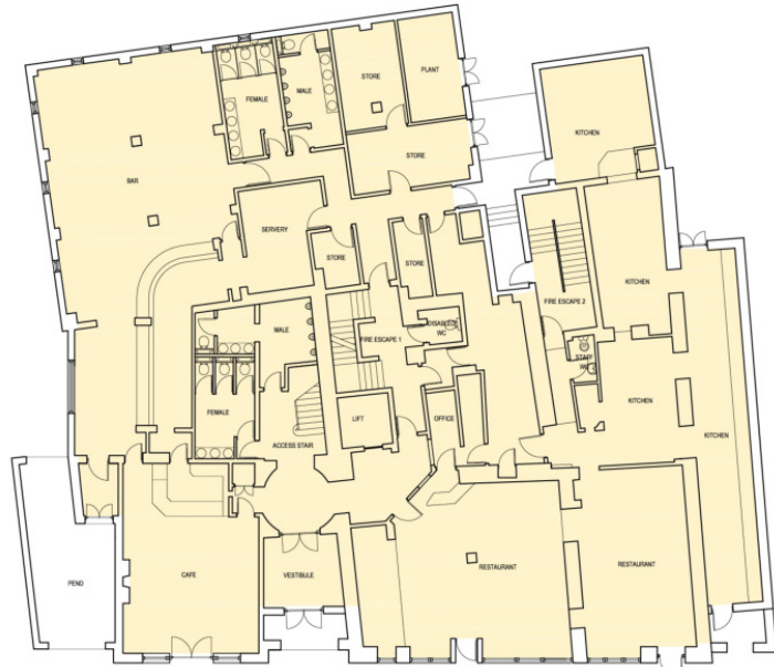
GROUND FLOOR PLAN- GROSS FLOOR AREA- 631 sq.m