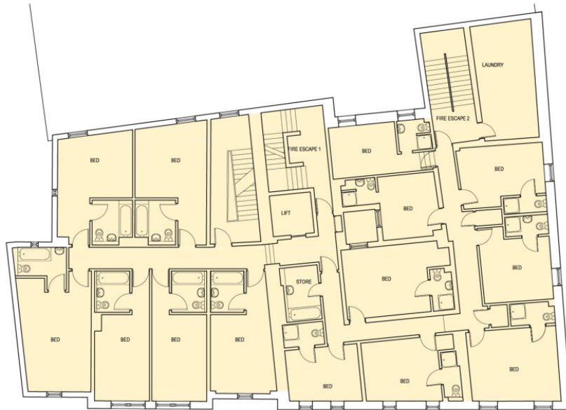
SECOND FLOOR PLAN- GROSS FLOOR AREA- 405 sq.m