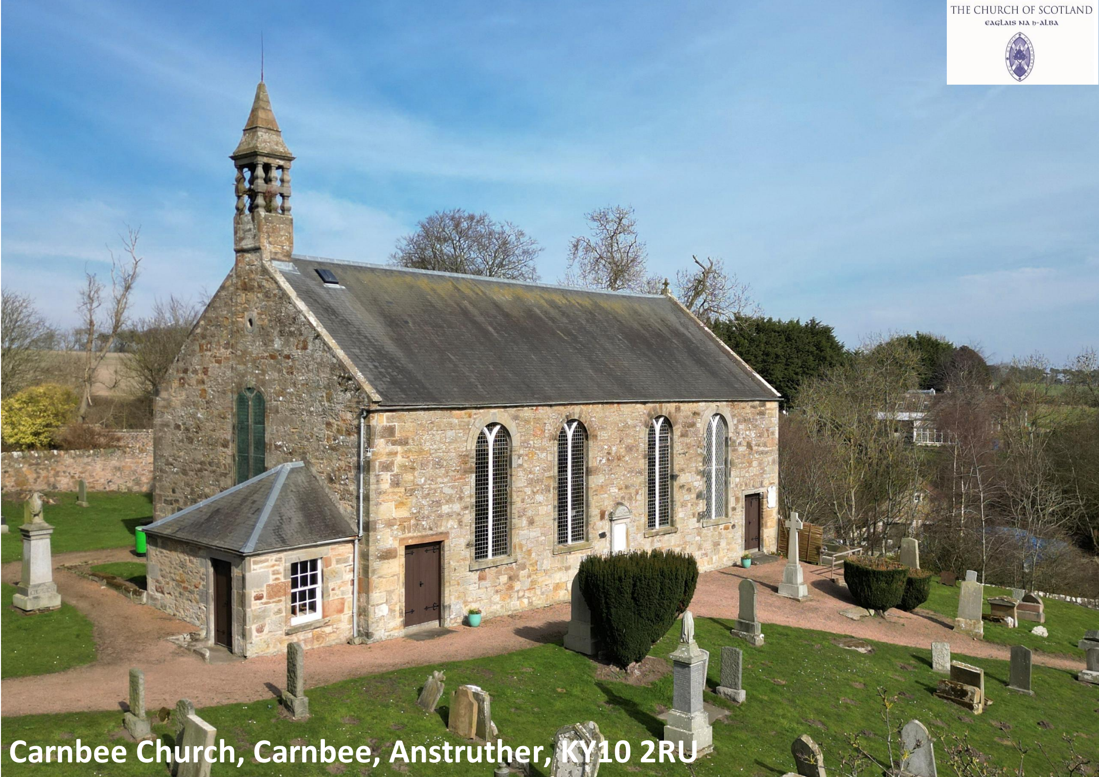
Carnbee Church, Carnbee, Anstruther, KY10 2RU