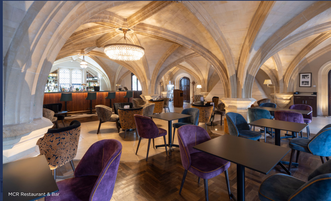
MCR Restaurant & Bar