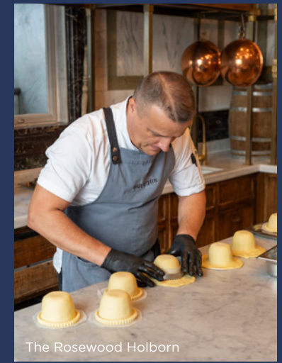
The Rosewood Holborn