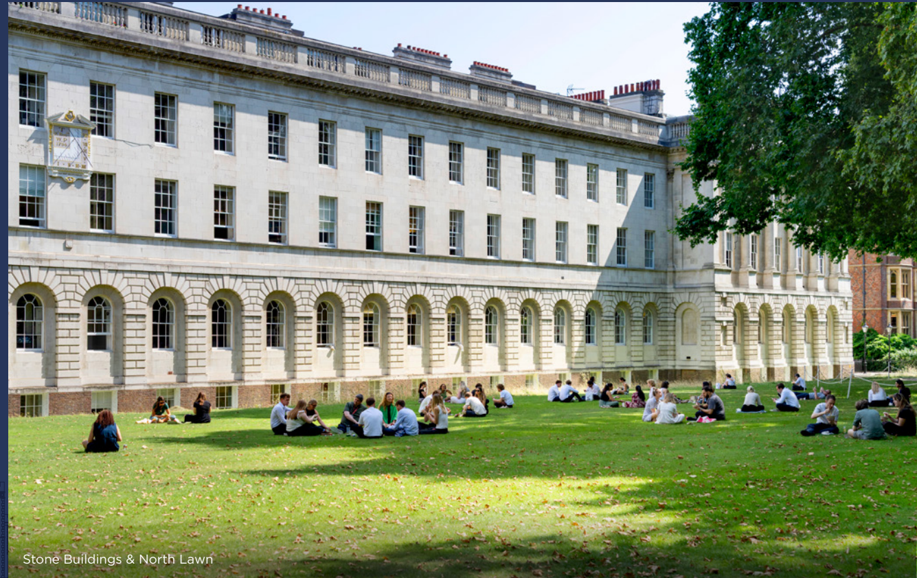
Stone Buildings & North Lawn