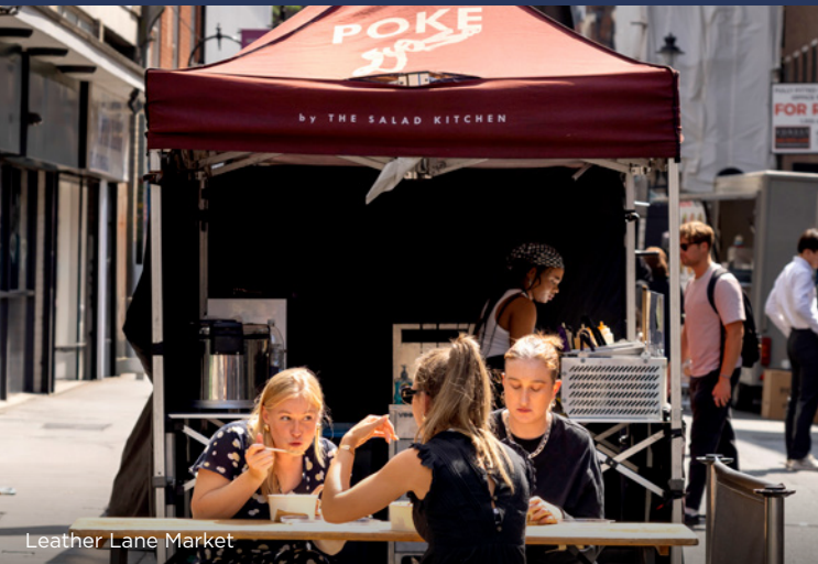
Leather Lane Market