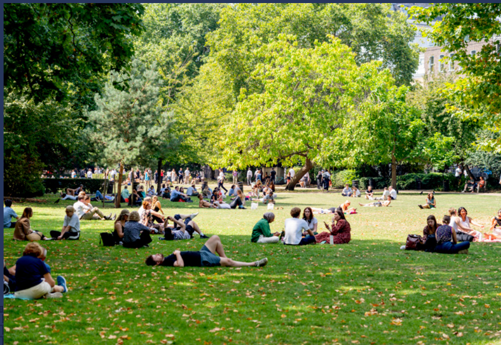
Lincoln's Inn Fields