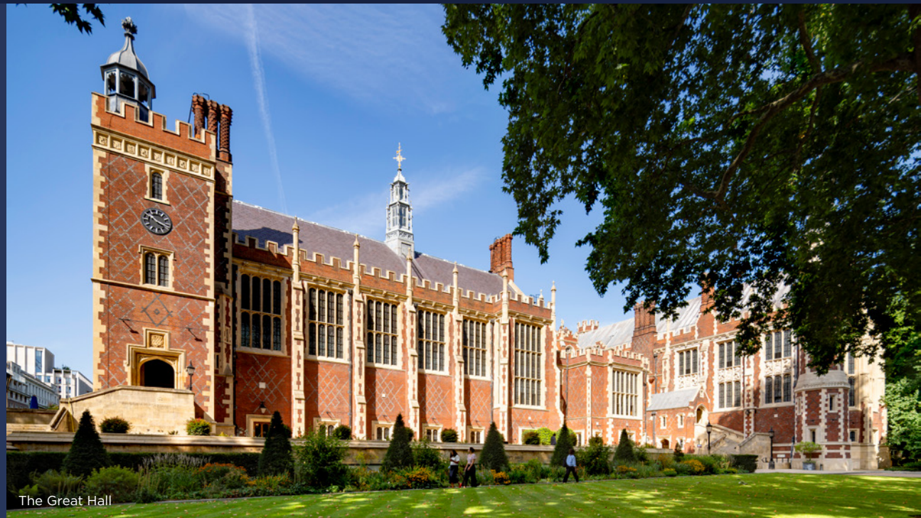
The Great Hall

Lincoln's Inn Estate is a historic and prestigious location in Midtown featuring a blend of beautiful architecture, including Tudor-style buildings, Georgian terraces, event spaces and modern offices, all set around peaceful gardens and courtyards. The Estate offers a range of offices across various buildings. Modern amenities include fully equipped meeting rooms, secure bike storage, and 24-hour access.