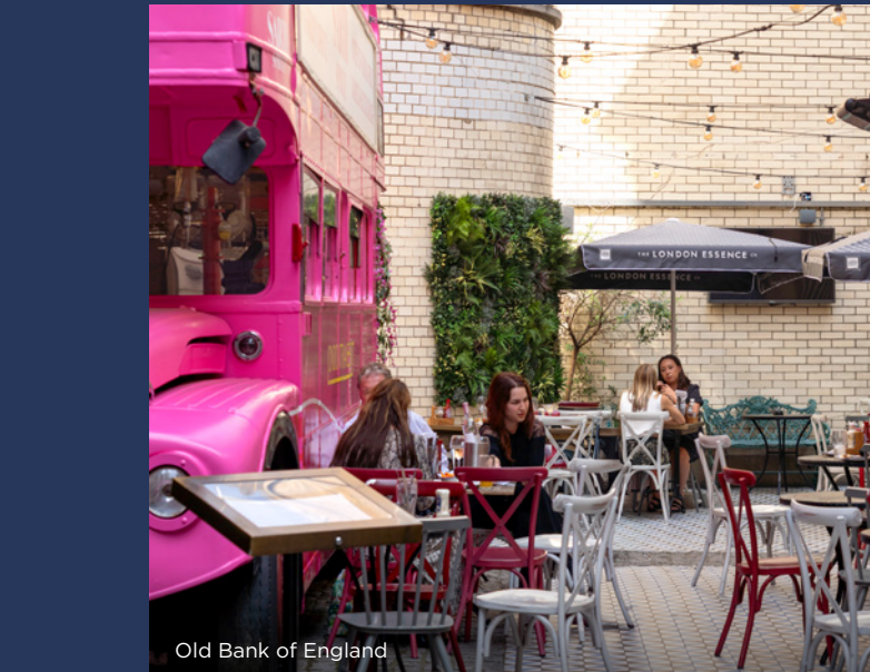
Old Bank of England