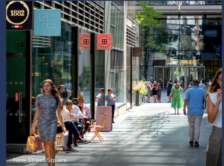
New Street Square