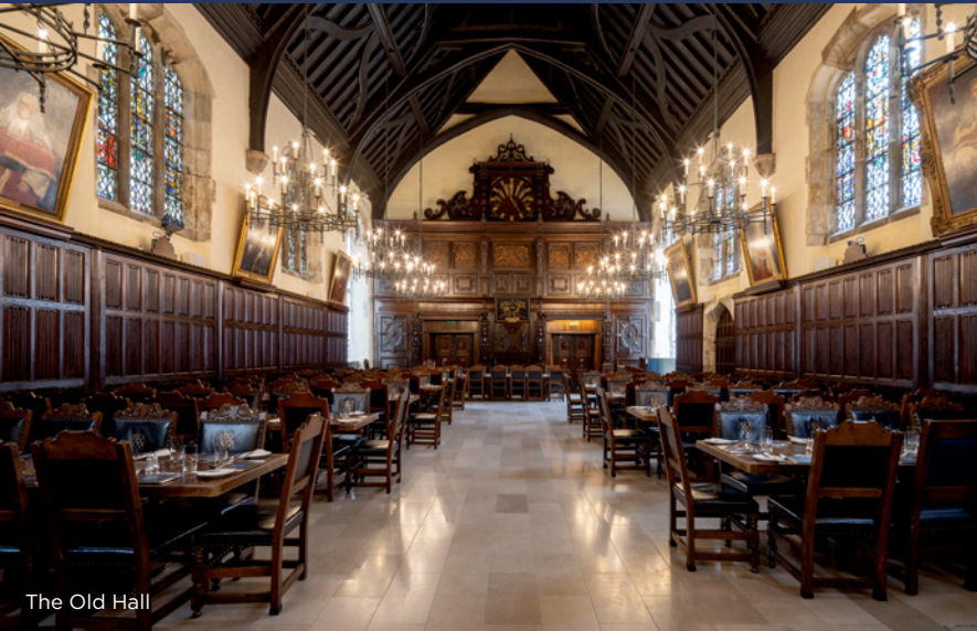
The Old Hall