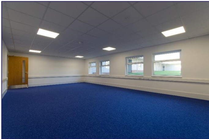
Small Office Suite