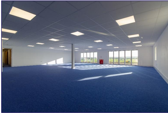
Large Open Plan Office Suite