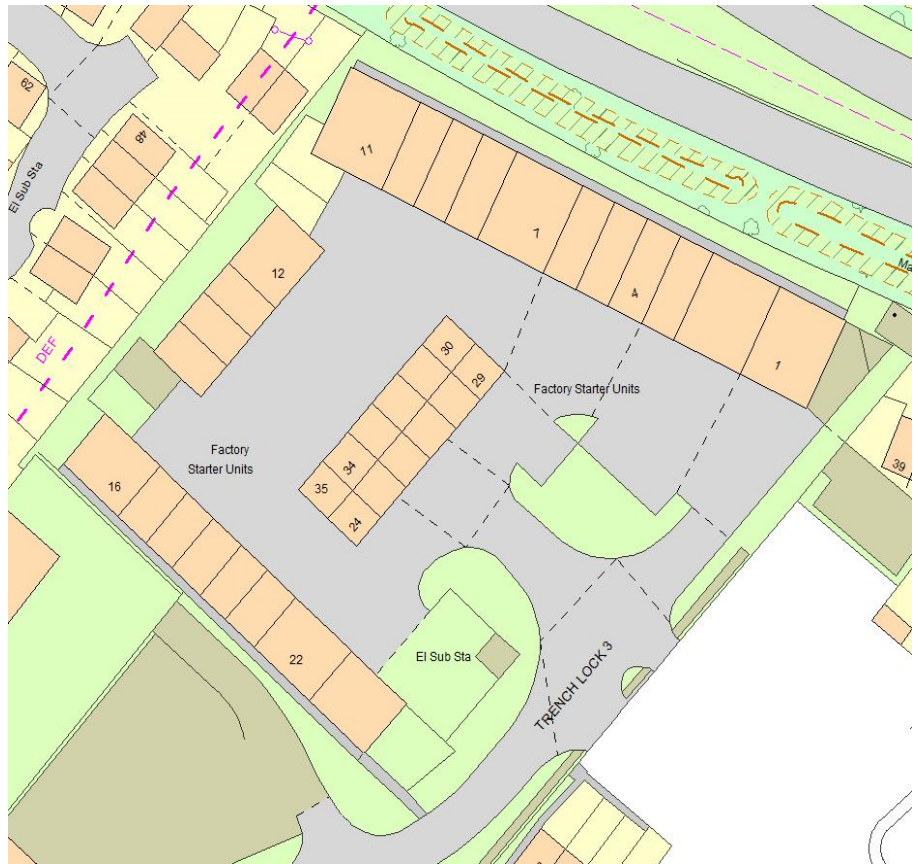
Plans for Illustrative Purposes Only: