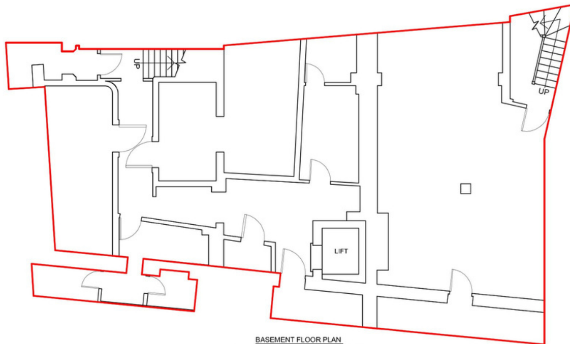
BASEMENT FLOOR PLAN Gross Internal Area 169 SqM / 1819 SqFT