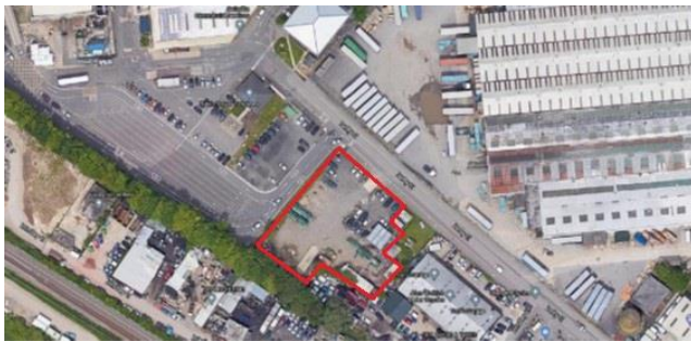
Site with approximate boundary for identification only

The site has previously had portacabin offices where the water supply and drainage has now been capped off.