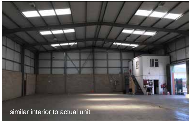
similar interior to actual unit