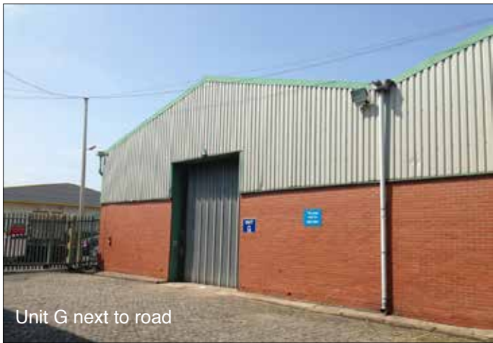
Unit G next to road