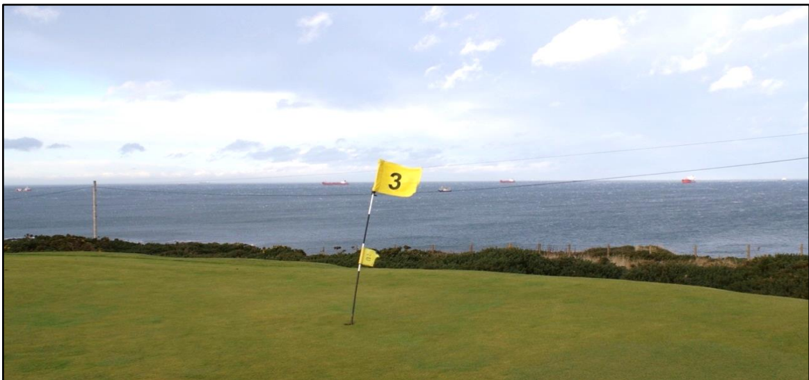
View from the sites looking towards the Moray Firth

We are delighted to offer for sale these nine building plots situated in a quiet location on the outskirts of Macduff.