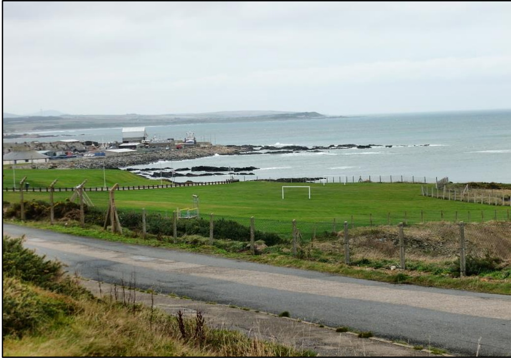
The view from some of the sites looking towards Macduff Harbour, Banff Bay and Whitehills beyond.