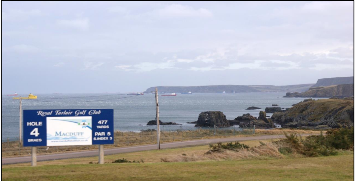
View from the sites looking towards Crovie & Gardenstown