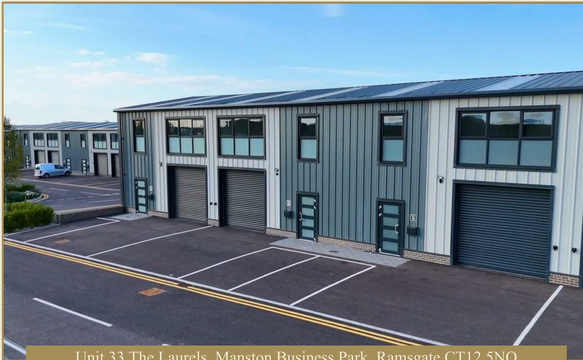
Unit 33 The Laurels, Manston Business Park, Ramsgate CT12 5NQ