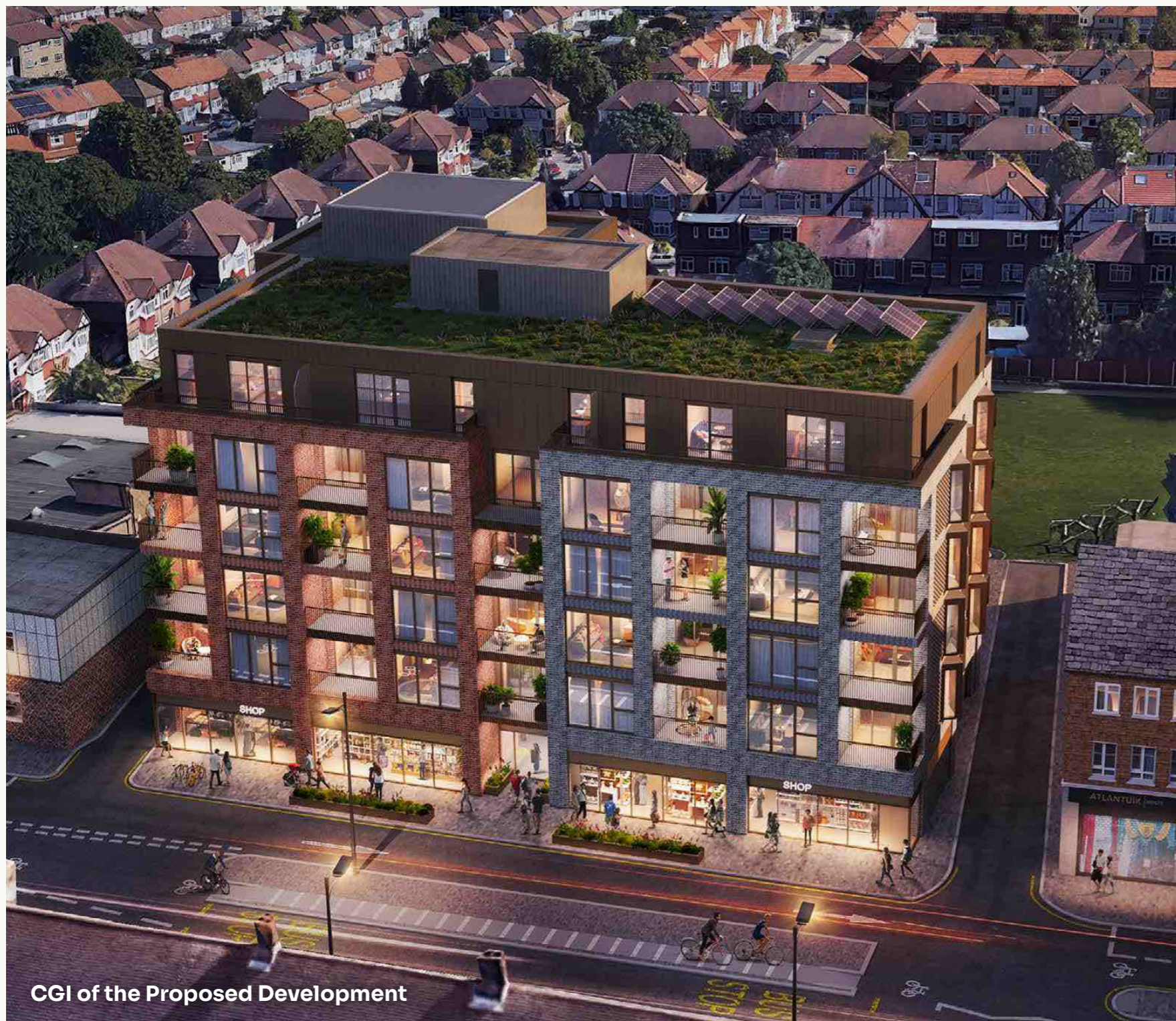
CGI of the Proposed Development