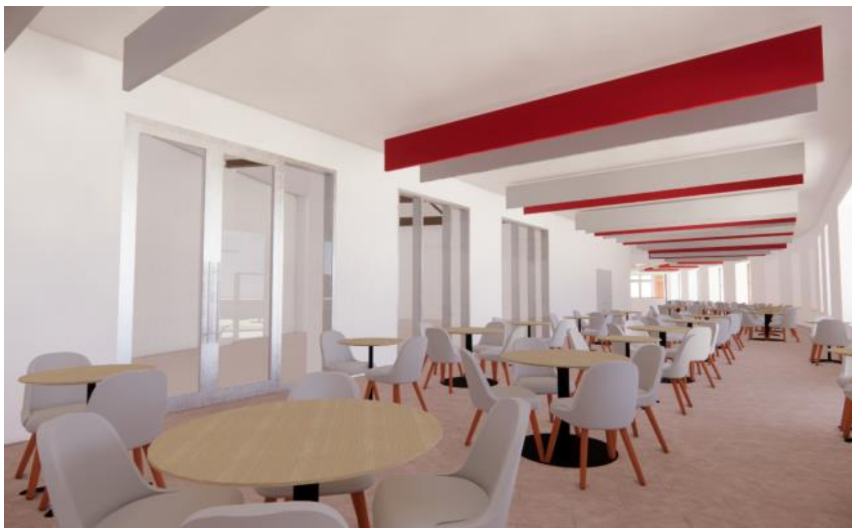
CGI of cafe seating area

WC's: WC's and Family Room WC adjoin the café and will be available for café staff and customers as well as all other centre users