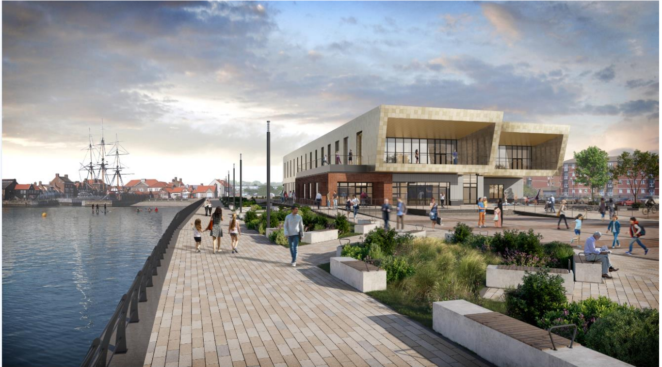
CGI of Highlight Leisure Centre

Rarely do opportunities of this nature become available