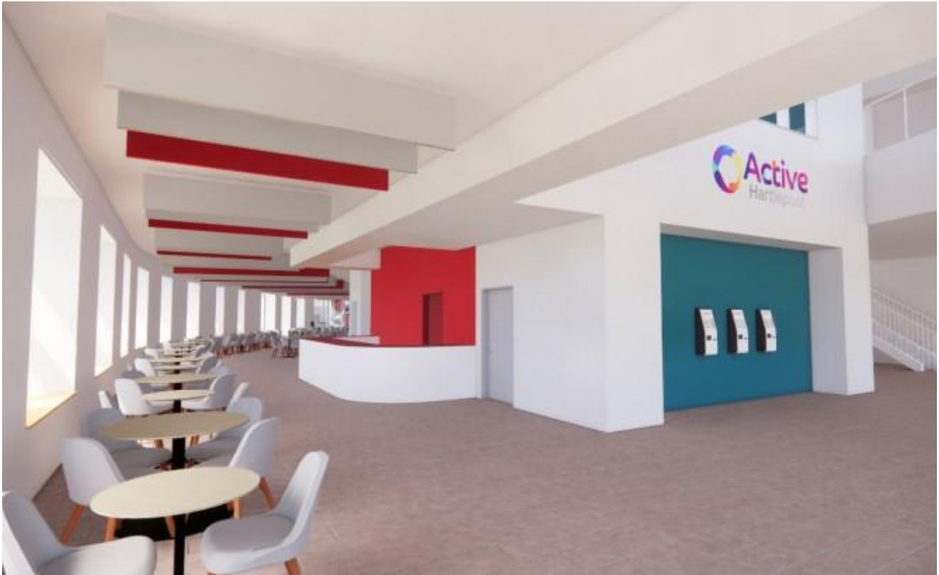
CGI of café seating area and servery