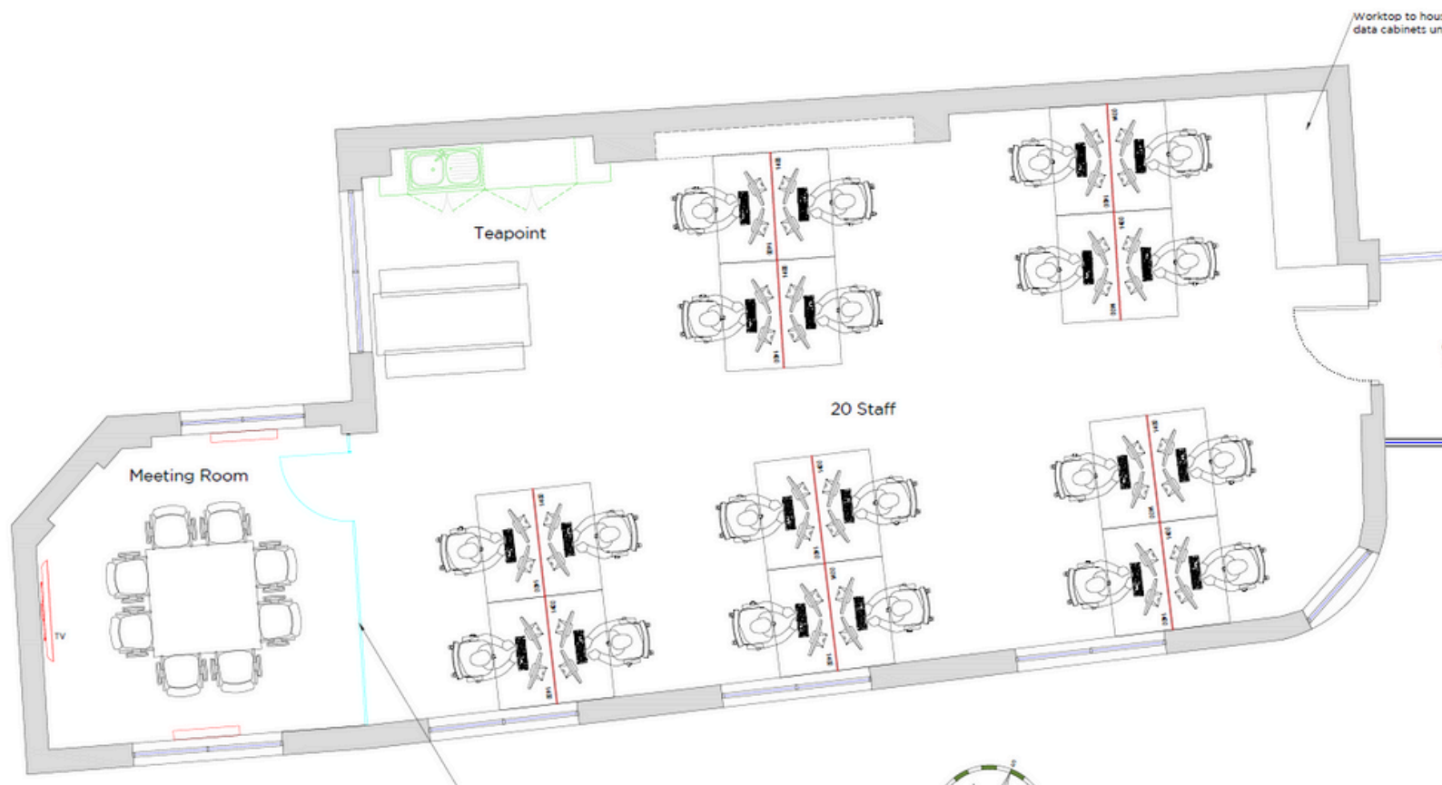
Space plan example layout only.