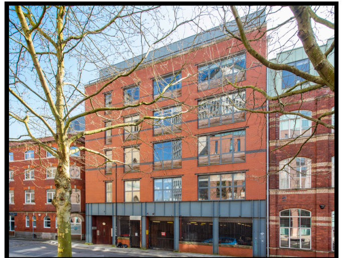
St Thomas Court, Thomas Lane, Bristol, BS1 6JG