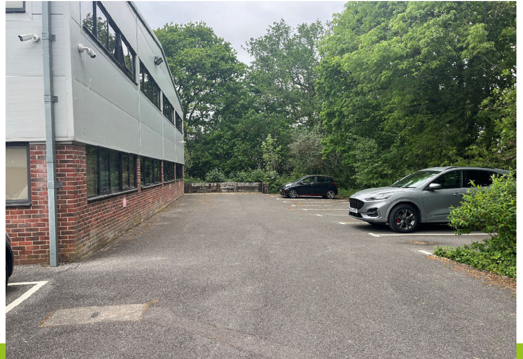
Warehouse - Side parking