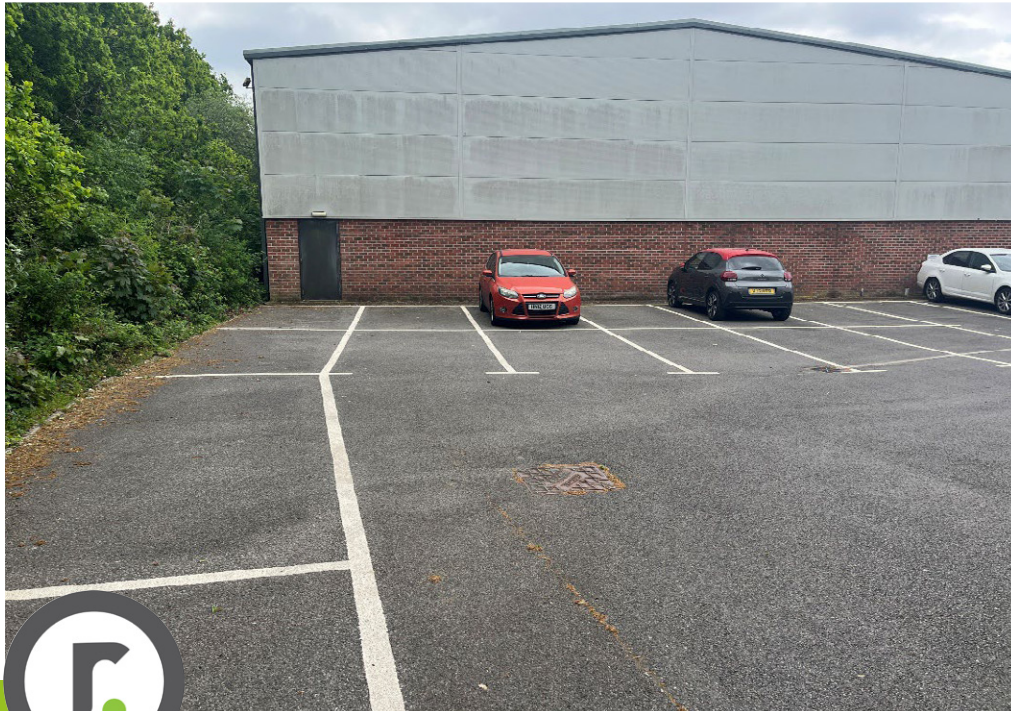
Parking at side of neighbouring warehouse