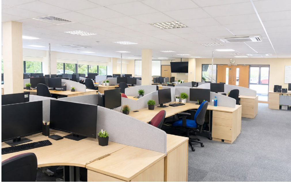
Ground floor - Open plan office