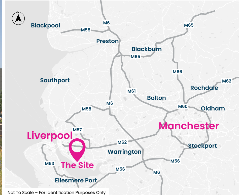
Not To Scale – For Identification Purposes Only