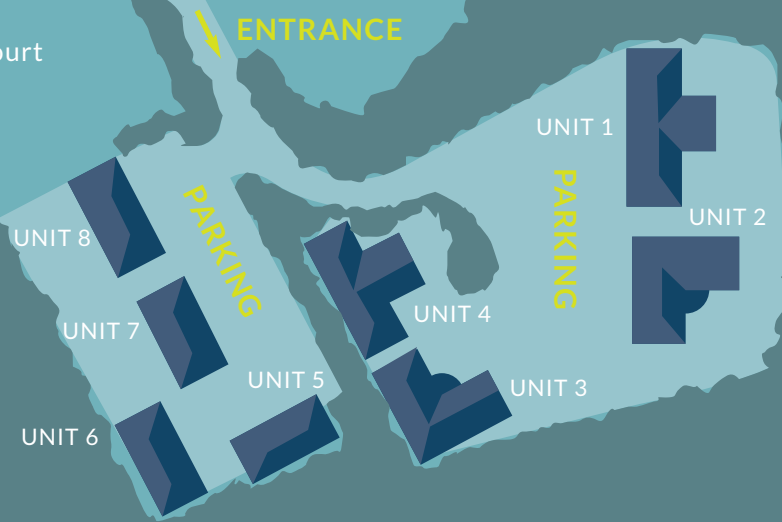
Swanwick Court site map

ALFRETON IS SITUATED IN THE ADMINISTRATIVE REGION OF AMBER VALLEY, LYING ADJACENT TO THE A38 DUAL CARRIAGEWAY, APPROXIMATELY 13 MILES TO THE NORTH OF DERBY, AND A SIMILAR DISTANCE NORTH WEST OF NOTTINGHAM.