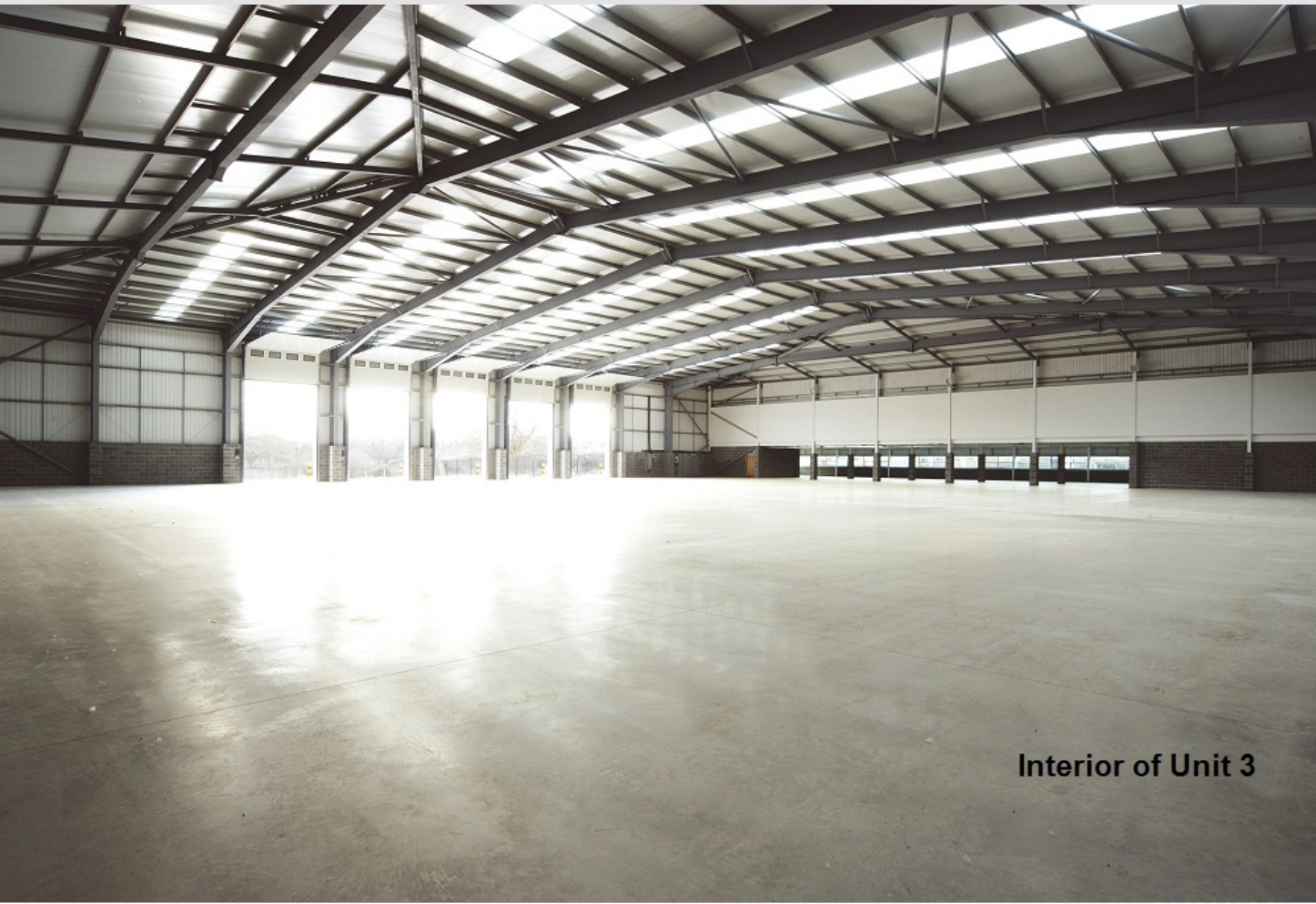
Interior of Unit 3